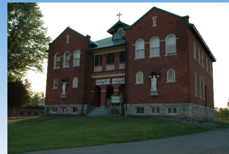
RAISIN REGION HERITAGE CENTRE