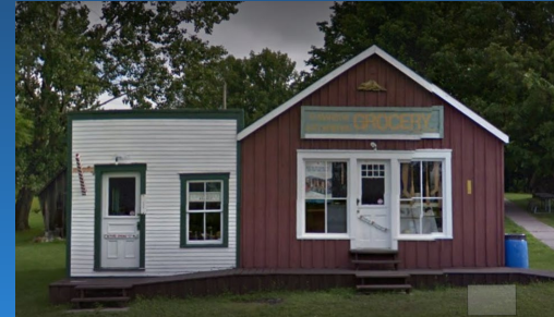
LOST VILLAGES MUSEUM

Lease Agreements & Negotiations Research and Public Meetings