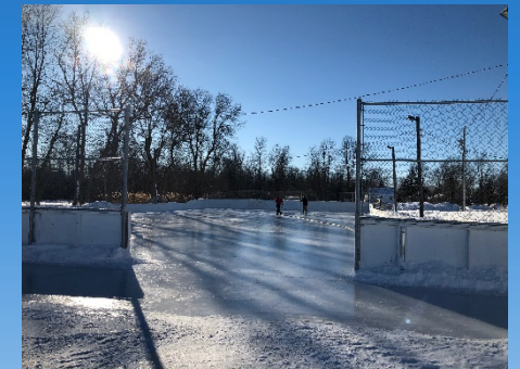
ST. ANDREWS PARISH SPORTS FIELDS