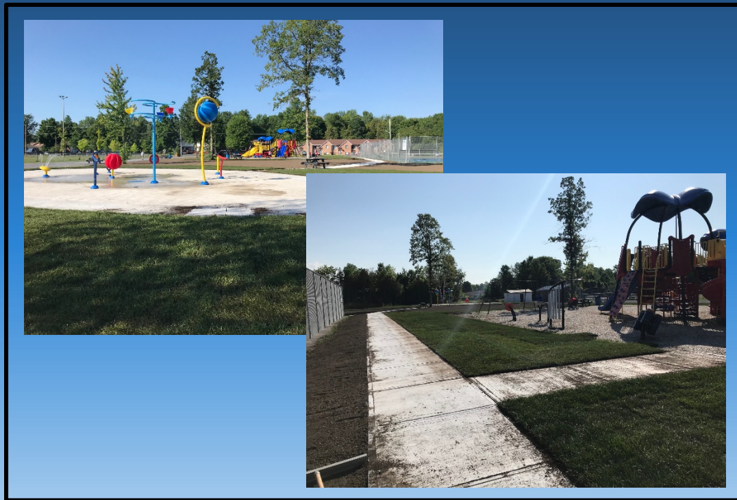
Ingleside Community Park Completion of Splash Pad & Landscaping